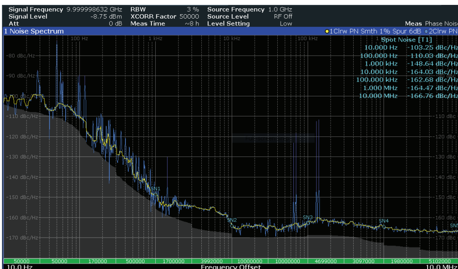
Measurement instrument-limited phase noise trace for a 10 GHz carrier signal.

The UMS-Mini is the microwave frequency source with the lowest phase noise on the market. In a compact 200-liter volume, the rack mountable system can be configured to provide multiple output frequencies from the RF to up to 20 GHz (higher on custom request). It includes a fully autonomous ultra-stable laser and a frequency comb. The system is the result of years of fine engineering. 1, 2, 3