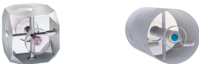
Reference Cavity Spacers

Every system is baked-out during the assembly process. The built-in NTC and Peltier elements are accessible via vacuum feedthroughs, allowing for operation at the zero crossing of the coefficient of thermal expansion (CTE). Characterization of the CTE is available on request. Both cavities are also available without enclosure.